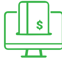
ONLINE TRIAL BALANCE