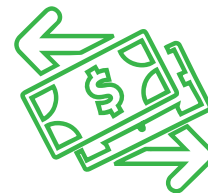
MULTIPLE CASH-BANK MANAGEMENT