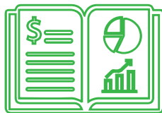
AUTO OR MANUAL JOURNAL POSTING