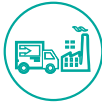
CONTRIBUTION BASED DISTRIBUTION