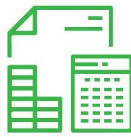
AUTO DATA FEEDING OF ACCOUNTING SOLUTION INTO PF