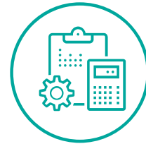
INTEGRATION WITH ACCOUNTING, PAYROLL & HR