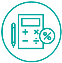
AUTOMATED SALARY CALCULATION