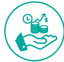
FLEXIBLE PARTIAL PAYMENTS